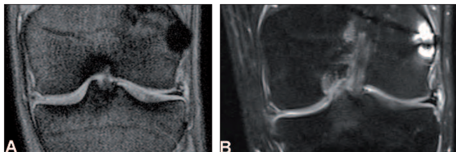
Fig. 2. MR features of the meniscal implant at 12 months (A) and 24 months (B). The implant signal, remaining hyperintense compared with that of normal meniscus, confirms its presence.

On MR evaluation, implants were always stable, properly located, and comparable in size to the native meniscus, albeit the signal was always hyperin-