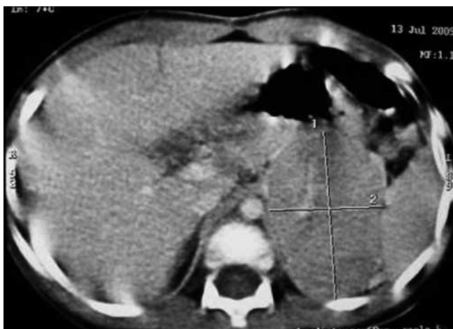
Figure 1: Contrast enhanced computed tomography-left suprarenal mass showing rim-like enhancing capsule