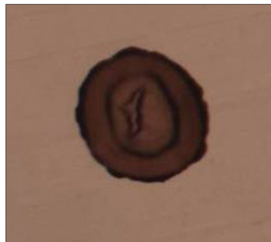
Figure 2: Low power microscopic picture of Aggregatibacter actinomycetemcomitans showing central star shaped colony

The male to female ratio in our study was 0.8:1. That is, females were more affected than males as observed in studies by Sixou et al. , [12] Salari and Kadkhoda [16] Daniluk et al. , [5] Nonnenmacher et al. [17] and Socransky et al. [6] In contrast in a study conducted by Sixou et al. [18] the ratio was M:F::1.3:1. However, there is no established, inherent difference between men versus women in their susceptibility to periodontitis. [15] 78.34% of our isolates were polymicrobial in nature in comparison to 11.06% of monomicrobial isolates. Our observations are consistent with the literature. [4,12,16,17,19] Polymicrobial nature of periodontal plaque has been well established. In the studies conducted by Sixou et al. [12] Nonnenmacher et al. [17] Saini et al. [4] and Mane et al. [19] 97.14%, 100%, 72.28% and 97.3% of their isolates were polymicrobial, respectively. In contrast Salari and Kadkhoda [16] observed 18.28% of their isolates were polymicrobial.