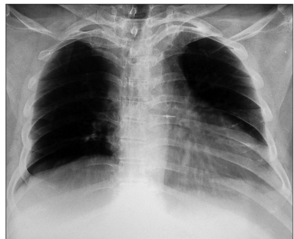
Figure 1: Lateral chest view with the impacted endodontic file lodged at the T4 level

The patient was immediately admitted to the Emergency Room for evaluation. A posteroanterior radiograph of the chest demonstrated the presence of a sharp foreign body at the level of the T4 vertebral body [Figure 1]. A diagnostic Computed Tomography scan (CT) was taken, which showed the endodontic instrument impacted on the left main bronchi [Figure 2]. Bronchoscopy done under General Anesthesia revealed that the endodontic instrument had pierced the mucosal folds tangentially, and was embedded in the wall of the left bronchial mucosa, buried up to the handle [Figure 3]. Using a bronchoscopic grasper, the handle of the endodontic instrument was grasped, gently pulling it out of the mucosal fold [Figure 4]. The site of penetration of the