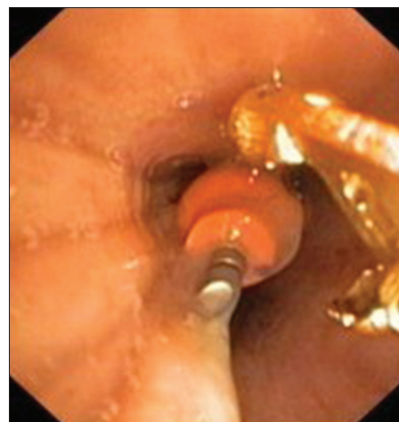
Figure 4: Photograph of the bronchus showing the bronchoscope grasper engaging the endodontic file during retrieval

mucosa was inspected for bleeding and perforation. The endodontic instrument was then retrieved along with the withdrawal of the bronchoscope, under full visualization throughout the retrieval process. The patient was subsequently discharged with no complaints of discomfort on follow-up.