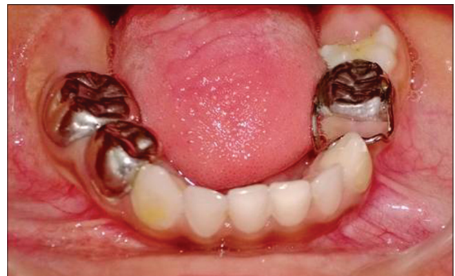
Figure 8: Post-operative view of lower jaw with crown band and loop irt 74