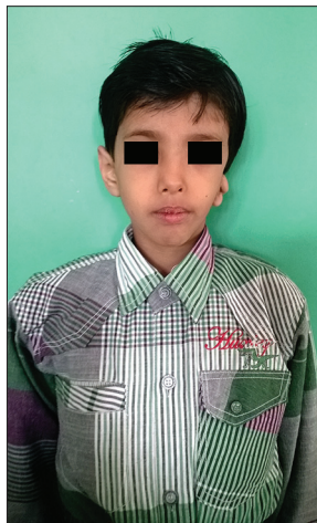
Figure 1: Hypertelorism with micro-cornea, congenital nevus and retinal coloboma in left orbit

The child was referred to a pediatrician, ophthalmologist, cardiologist and otolaryngologist for further evaluation. Congenital and structural echocardiography, were performed to rule out cardiovascular malformations. Renal scan found renal measurements to be within normal limits. Hemogram was also found to be within the normal range. The ophthalmologic examination of the left eye confirmed congenital nevus and coloboma of retina and iris. Bilaterally, the vision was within normal range. Audiometric tests revealed mild conductive hearing loss in the right ear and moderately severe conductive hearing loss in the left. Minimal adenoidal hypertrophy was radiologically confirmed.