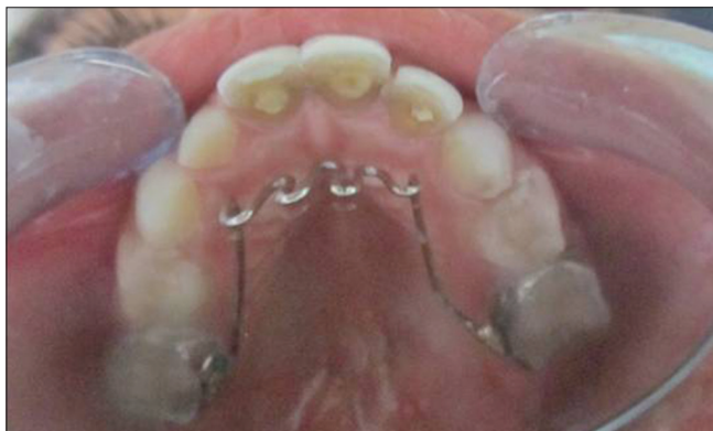
Figure 7: Post-operative view of upper jaw with tongue cribs

The consent was obtained from the patient for the use of unblinded photos as eye features, which are important for the diagnosis of Goldenhar syndrome.