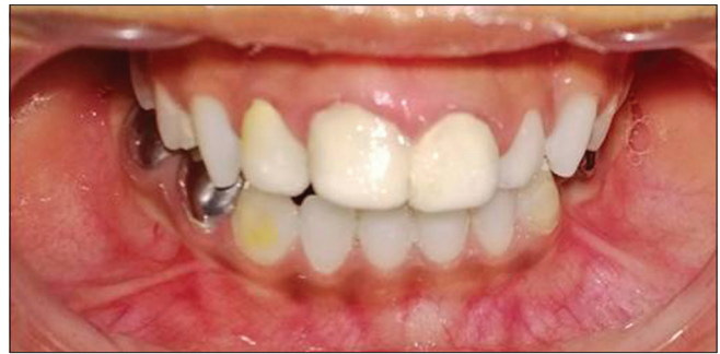
Figure 10: Correction of tongue thrust after 4 months

The findings in the present case were in accordance with criteria given by Feingold and Baum, which included a lipodermoid or lipoma of the conjunctiva, an epibulbar dermoid or an upper eye lid coloboma and two of the following three: Small size or abnormal shape of the ears or pre-auricular skin tags or both, unilateral aplasia or hypoplasia of the ramus of the mandible and vertebral anomalies for the delineation of Goldenhar syndrome. [1] However, no vertebral, cardiovascular or renal malformations were found to be associated. Although, the right side is frequently involved, in most cases our patient showed involvement of the left side of the face. A significant finding was the presence of an anterior tongue thrusting habit. The child had a deviated