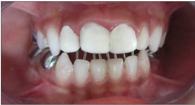
Figure 9: Tongue crib appliance for correction of anterior tongue thrust

Soltan and Holmes suggested a link between genetic causes and vascular disruption in Goldenhar syndrome. [9] Although, most of the cases are said to be sporadic, familial cases of autosomal dominant and autosomal recessive inheritance have been reported. [10] Furthermore, multi-factorial modes of inheritance have also been suggested. The other etiological factors include use of vasoactive drugs in the first 10 weeks of gestation, especially in conjunction with smoking, multiple gestations, fetal exposure to primidone, [11] retinoic acid, [12] thalidomide, [13] maternal diabetes, [14] rubella and influenza. [3] In the present case, maternal history was non-contributory with no positive history of a similar condition in the family. The case was found to have an autosomal dominant (DeNovo) pattern of inheritance.