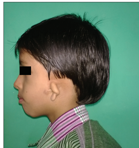
Figure 2: Malformation of the left ear