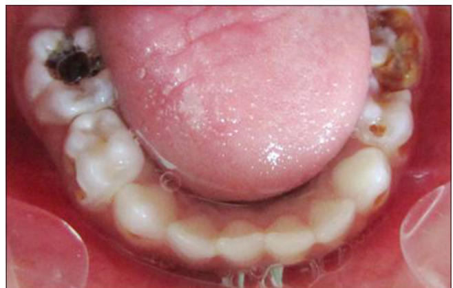
Figure 4: Pre-operative features of lower arch