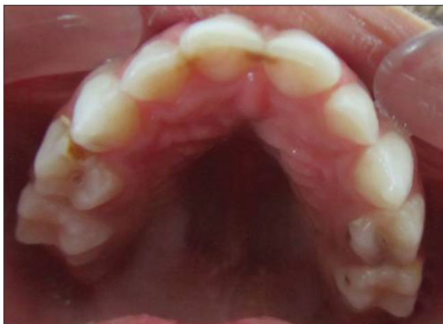
Figure 3: Pre-operative view of upper arch