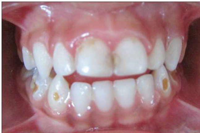
Figure 5: Anterior tongue thrust

As there were no systemic abnormalities, antibiotic prophylaxis was not recommended. Oral hygiene was improved through professional prophylaxis and home care instructions. Composite restorations were placed on 54, 65, 73 and 83. Pulpectomy was carried out in relation to 51, 52, 61, 75 and 85 followed by stainless steel crowns for 75 and 85 and composite esthetic restorations with 51, 52 and 61. Caries excavation and glass ionomer restoration was done on 84 followed by placement of stainless steel crown. Extraction of 74 was carried out followed by placement of crown, band and loop space maintainer [Figures 7 and 8]. A fixed habit-breaking appliance was given to intercept the tongue thrusting habit [Figure 9]. Open bite correction was seen at the end of four-month recall visit [Figure 10].