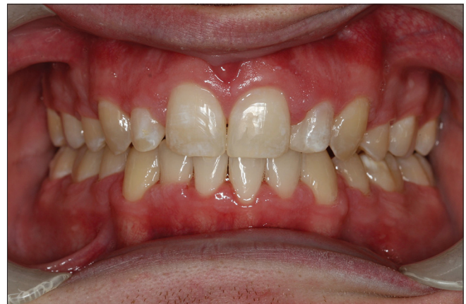
Figure 2: Initial panoramic view. Under developed clinical crowns on teeth number's 7 and 10 and an overall asymmetry of the gingival margins