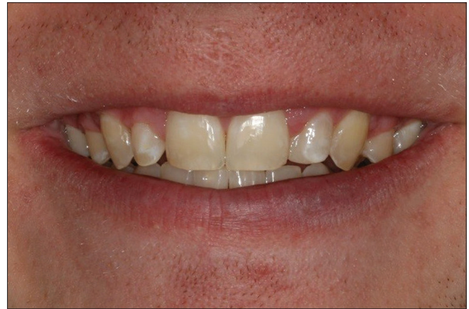
Figure 1: Initial smile. After completion of orthodontic treatment and before the periodontal surgery and restorative procedures

The patient decided to pursue take home bleaching (10% carbamide peroxide) for a period of 6 weeks and decide