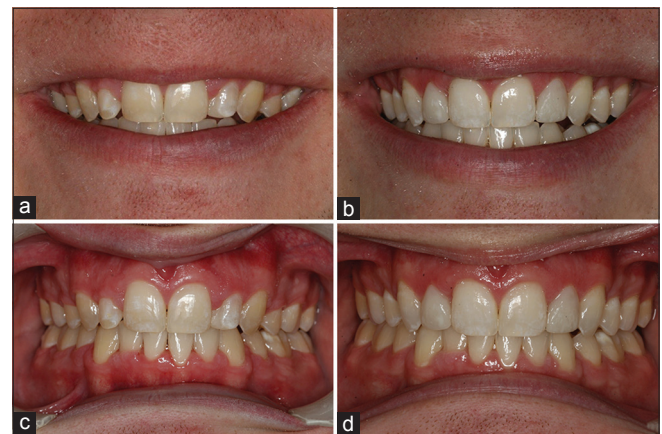
Figure 5: (a) Initial smile, before the periodontal and restorative treatment. (b) Final smile, 24-month after the periodontal and restorative treatment. (c) Initial panoramic view, before the periodontal and restorative treatment. (d) Final panoramic view, 24-month after the periodontal and restorative treatment

Investigations have shown that minimal gingival display during smile is considered more attractive. Usually, dental professionals are more critical than laypersons regarding gingival display. [10] However, it has been shown that even laypersons classify the smile as "unattractive" when it shows an inadequate amount of gum tissue and/or asymmetric crown length or width. [2] In our case, the proposed treatment that solved the asymmetry