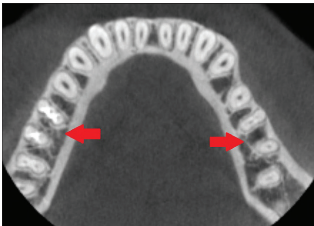
Figure 2: Tooth 36 with two roots and five canals (left arrow) and tooth 46 with two roots and three canals (right arrow)

study, an extra distolingual root was observed in 11.9% of the cases. This prevalence is lower than that found in Western China population [16] (25.8%) and Taiwanese population [5] (25.3%). However, the incidence of three-rooted MFPM is higher than previous studies of Caucasians (4.3%), [23] Sudanese, and Senegalese (3.0%) patients. [3,31] It is not clear whether this variation is due to sampling variation related to location and diversity of ethnic as result of migration and mixed genetic. For example, regional differences were observed in the prevalence of three-rooted MFPM of Taiwanese, whom the prevalence was greater than other oriental populations [11,25] and mentioned as a special characteristic of their dentition. [32] Although the number of cases with three roots MFPM is small in the present study sample, a special attention should be given to such cases as it increases the challenge to carry out root canal cleaning and shaping of this additional root also known as radix entamolaris.