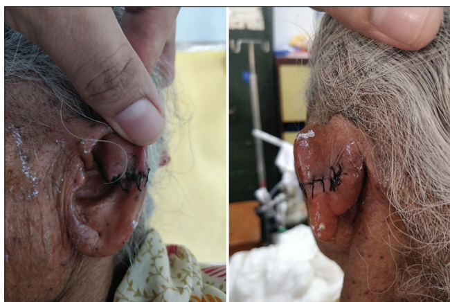
Figure 2: Postoperative images after excisional biopsy of verrucous growth over the helix of the left pinna