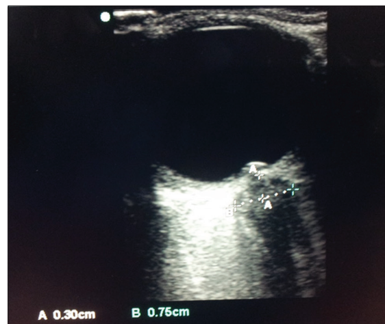
Figure 3: Ultrasonography image of optic nerve sheath diameter measurement. The figure shows the ultrasound measurement of optic nerve sheath diameter in centimetres. The caliper 'A' measures the depth (from the eyeball) at which the optic nerve sheath diameter has to be measured (3 mm). 'B' measures the optic nerve sheath diameter (7.5 mm) at this depth