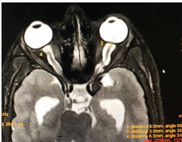
Figure 2: Axial films of magnetic resonance imaging images showing optic nerve sheath diameter measurements. The figure shows the measurement by electronic calipers in millimetres. 1 and 3 measure the distance from the eyeball at which the optic nerve sheath diameter measurement is taken. 2 and 4 measure the optic nerve sheath diameter at a depth of 3 mm from the eye ball

Helmke and Hansen used ultrasound in cadavers to prove that in the area just behind the eyeball, elevated pressure can increase the sheath diameter by >50%. [30] In another study, the same authors used intrathecal infusion tests to prove that the ONSD varies with alteration of lumbar CSF pressure. [31] A similar study was done by Tamburrelli et al. , who showed that the