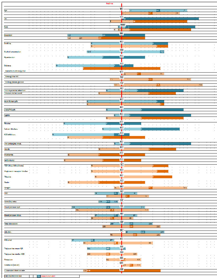
Fig. 1 An example of a Scale Chart comparing a patient's characteristics (red vertical line, grey boxes) to the distribution of reported population characteristics of two clinical trials (blue and orange horizontal bars). Each bar represents the mean or median and the standard deviation or interquartile range (IQR), as indicated, for continuous variables, and relative frequency for categorical variables. Horizontal bars are aligned to correspond to the patient's characteristics. Different tones are used for different categories.

This document was downloaded for personal use only. Unauthorized distribution is strictly prohibited.