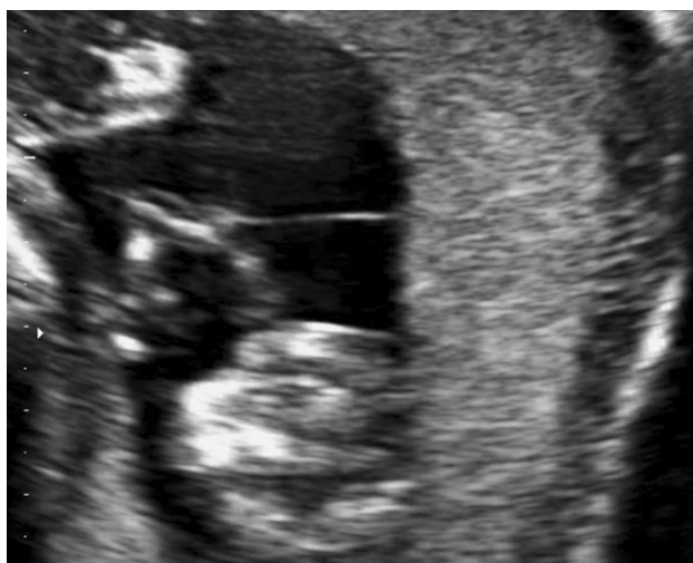
Fig. 2 Ultrasound image of T-sign in first trimester

at the time of the 11–14 weeks scan were included in the study.