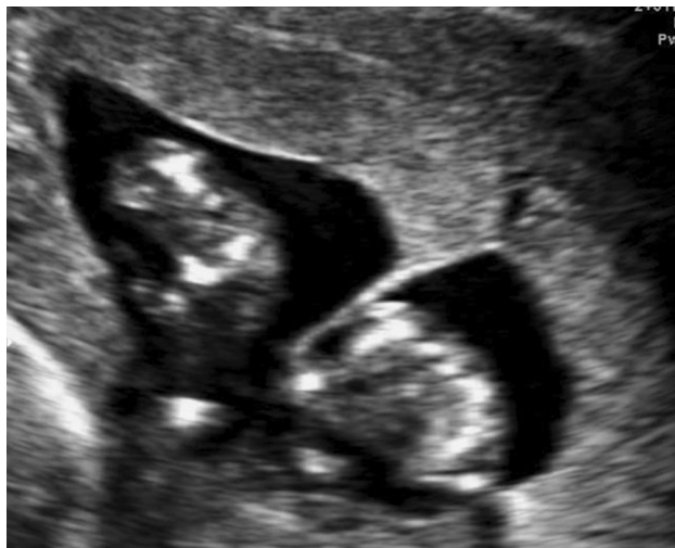
Fig. 1 Ultrasound image of lambda sign in first trimester