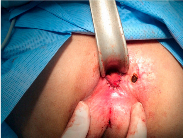
Fig. 4 – Final aspect of procedure.