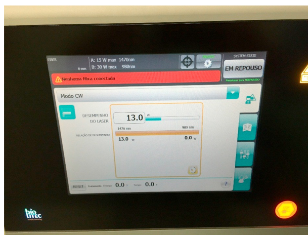
Fig. 3 – Leonardo generator.