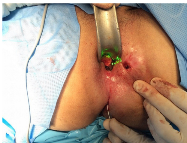
Fig. 2 – Activation of laser fiber.