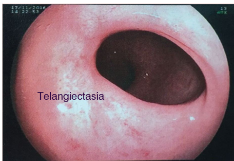
Fig. 3 – Endoscopic aspect of a patient with complete clinical response.

thus greater local and distance control, as well as better PFS and OS. 8 Considering this data, the real need for surgery in this group was questioned; Dr. Angelita Habr-Gama, from Brazil, was the first to conduct a study in order to elucidate this question and to experimentally adopt the wait-and-see policy (no surgical resection and vigilant follow-up).