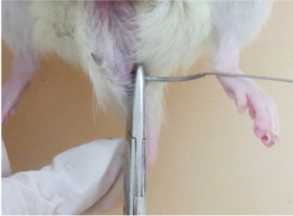
Fig. 1 – Transection of the anal sphincter with steel suture.

results not inferior to other techniques for fecal incontinence and lower recurrence rates. However, information about the influence of the suture used to perform the sphincter reconstruction is lacking; therefore, the present study aimed to provide new information on this issue.