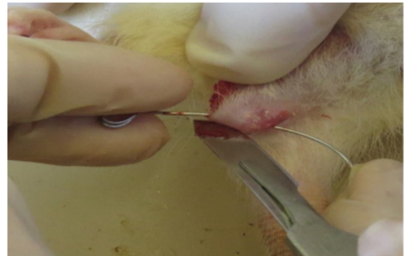
Fig. 3 – Scalpel fistulotomy.

Group C – Polypropylene sphincteroplasty: consisting of ten rats, in which the steel suture was removed, and a fistulotomy and primary sphincteroplasty were performed with 4-0 polypropylene suture;