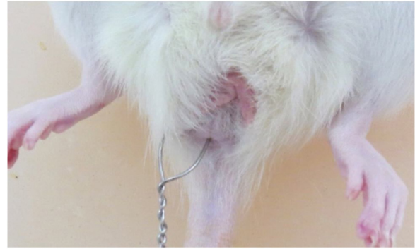
Fig. 2 – Steel suture positioned to create a fistula.

Group B – Fistulotomy: consisting of five rats, in which the steel suture was removed followed by fistulotomy and healing by second intention;