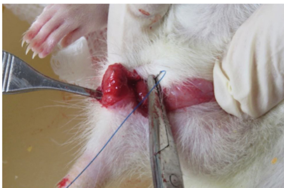
Fig. 4 – U-suture sphincteroplasty.

order to contain the fistulous path its entire extension. Specimens were identified and fixed in 10% buffered formalin. Subsequently, the material was processed in increasing concentrations of alcohol, diaphonized in xylol, and placed in histological paraffin; 5- \mu\text{m} cross sections were made with the aid of a rotary microtome (Microm HM320). The sections obtained were stained by the hematoxylin–eosin (HE) technique for qualitative histopathological analysis and Gomori trichrome (GT) to evaluate assess fibrosis sites, as this technique confers a green coloration to the collagen. The digital images of the HE- and GT-stained slides were captured in a Carl Zeiss photomicroscope coupled to a Samsung micro-camera connected to a computer with an image capture board (Figs. 5 and 6). The findings were read and interpreted by a