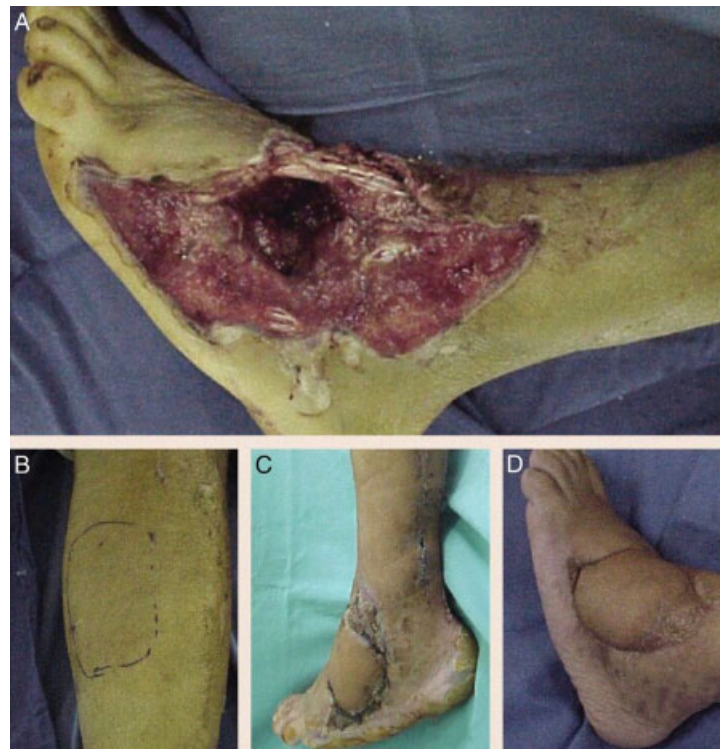
Fig. 2 Trauma by crushing. A, extensive lesion on the back of the foot with a critical area of 8 × 8 cm; B, donor area; C, receiving area after sural fasciocutaneous flap coverage; D, late postoperative period.