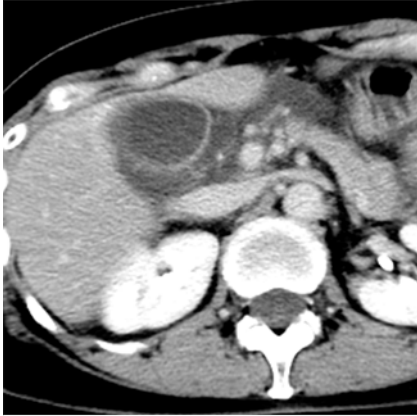
► Fig. 1 Abdominal computed tomography scan showing a localized fluid collection at the hepatic hilum in a 57-year-old woman who presented with acute upper abdominal pain.

Subvesical bile ducts, which are frequently incorrectly termed “ducts of Luschka,” traverse within, or in close contact with, the gallbladder fossa [1]. They are one of the most common etiologies of bile leak in cholecystectomy and have gained increased clinical attention in the present laparoscopic era. Subvesical bile ducts are hardly ever detected preoperatively because their mean diameter is 2 mm [1]. Indeed, in most patients, subvesical bile duct leaks are detected postoperatively, generally during the first postoperative week [2]. This report describes a case of spontaneous perforation of the subvesical bile duct.