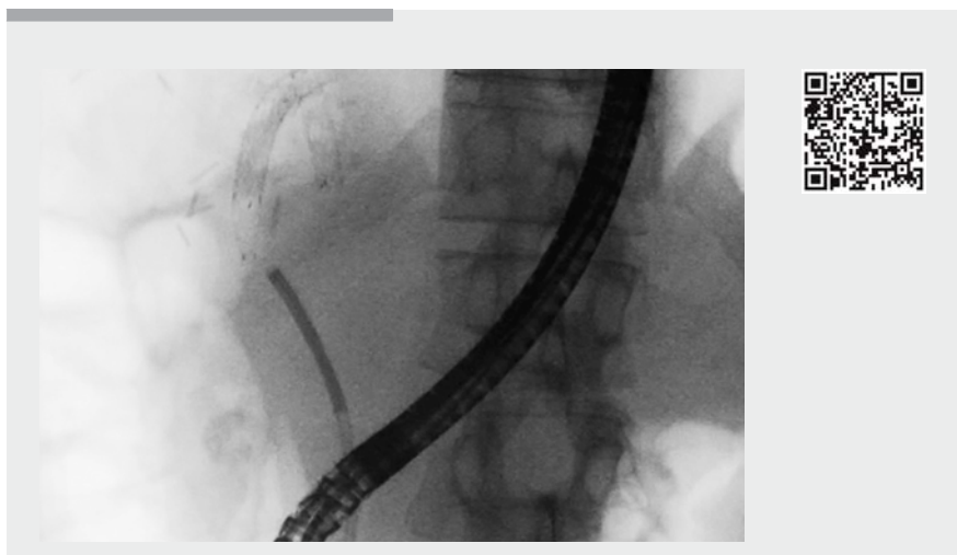
► Video 1 Stent–stone complex seen at the distal stent end on insertion of the digital intraductal cholangioscope into the bile duct. Electrohydraulic lithotripsy was performed, with subsequent visualization of the stent lumen. The guidewire was then inserted under cholangioscopic guidance.

Following insertion of a digital intraductal cholangioscope (SpyGlass DS; Boston Scientific Corp., Marlborough, Massachusetts, USA) into the bile duct, it was found that a stent–stone complex had formed at the distal stent end, and the lumen of the stent was completely obstructed (► Fig. 2 ). Therefore, electrohydraulic lithotripsy was performed for the stent–stone complex. Thereafter, the lumen was visualized, and the guide-