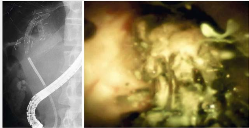
► Fig. 2 Cholangioscopy showed formation of a stent–stone complex at the distal stent end, with complete obstruction of the stent lumen.

A man in his 40s who had undergone right lobectomy for hepatocellular carcinoma, developed jaundice due to hilar biliary obstruction associated with recurrence of the cancer. Multiple metal stents were placed for the ventrolateral and dorsolateral segmental ducts, using a partial stent-in-stent method.