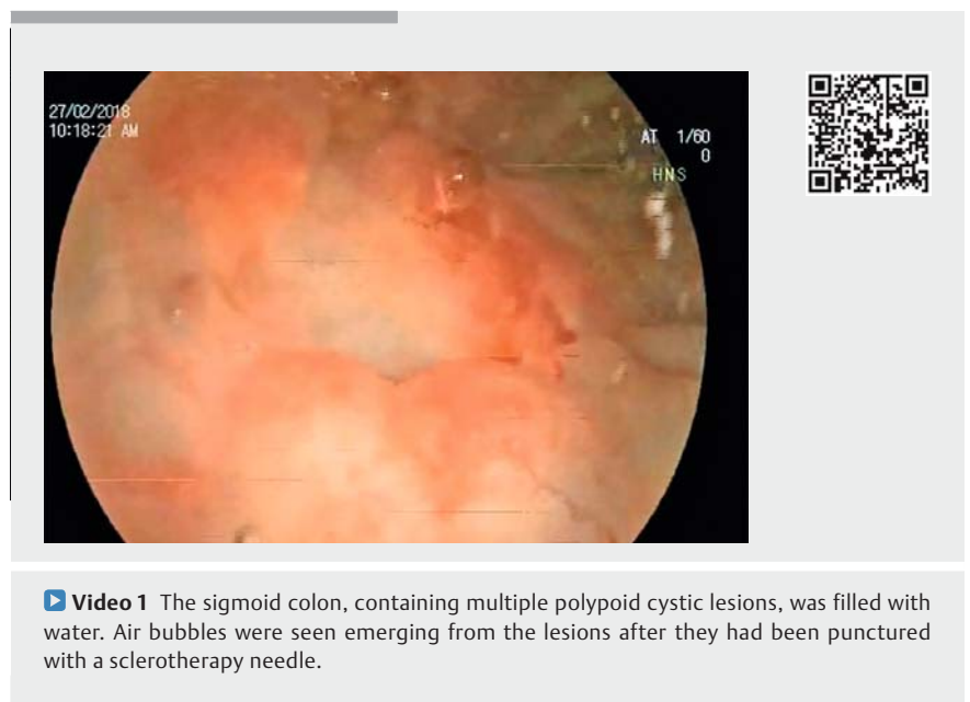
► Video 1 The sigmoid colon, containing multiple polypoid cystic lesions, was filled with water. Air bubbles were seen emerging from the lesions after they had been punctured with a sclerotherapy needle.

ary. Diagnosis is often made with radiologic or endoscopic imaging. We presented a case that was diagnosed endoscopically with water-immersion technique and puncture.