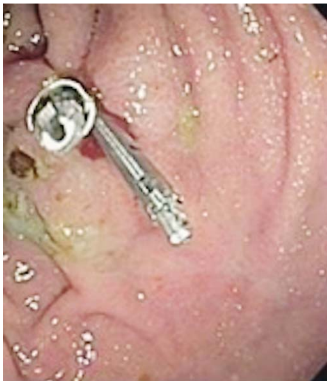
► Fig. 3 Abdominal CT showing pneumoperitoneum.

and two more Instinct hemoclips were applied to the ulcers to prevent bleeding (► Fig. 6 ). Post-procedure admission to the ICU was not necessary.