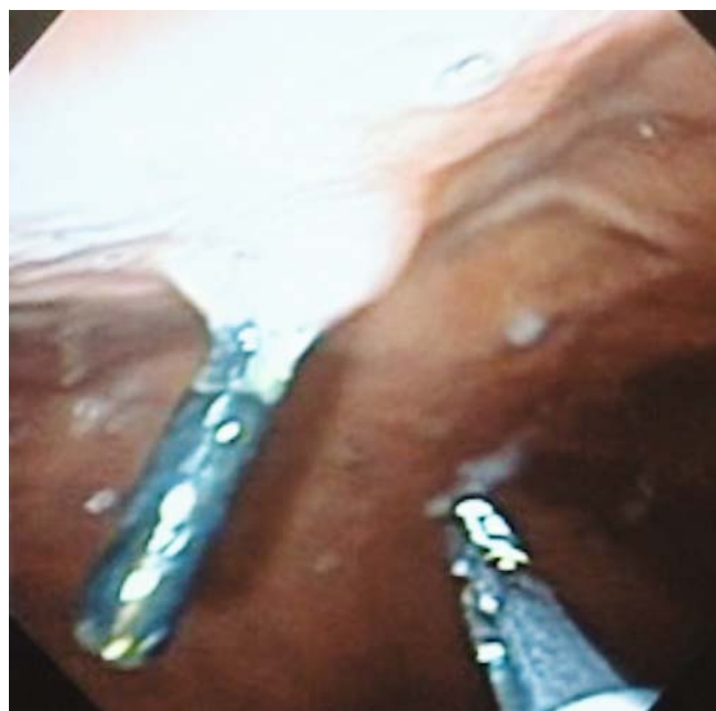
► Fig. 10 Endoscopy of case 2 to 6 months later.

The number of adverse events (AEs) associated with IGB insertion varies across studies. In one clinical trial of IGB use, Genco et al. [24] observed no such events. In another such trial, Ponce et al. [25] reported 28 AEs. Of the eight randomized controlled trials of IGBs conducted to date, only six reported AEs, with a weighted mean incidence of 28.2%. The weighted mean reported incidence of serious AEs was 10.5%, initial removal of the device being required in three studies [20, 26–27]. Severe AEs include persistent vomiting, abdominal pain, gastroesophageal reflux disease, deep ulcers, and perforation during endoscopy. Ulcers were reported in the studies conducted by Ponce et al. [25], Mohammed et al. [28], and Shelby et al. [29]. Although classified as a moderate AE, an ulcer, left untreated,