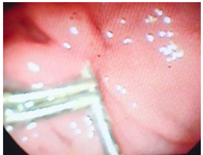
► Fig. 9 Perforation.