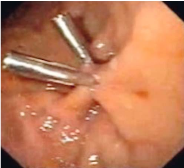
► Fig. 6 Exclusively endoscopic treatment with use of metal clips.