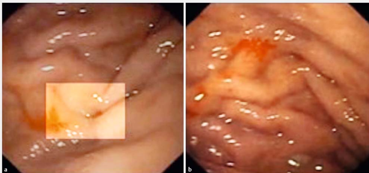
► Fig. 5 Site of perforation in the anterior wall of the gastric body.

At 72 hours after the procedure, the patient was free of complaints. She was started on a liquid diet, which was well accepted. Her leukocyte count was 14,900 cells/mm 3 , with no shift, and her CRP level was 18 mg/dL. The patient was discharged on Day 5 after admission. At this writing, she is in out-patient treatment and is still asymptomatic.