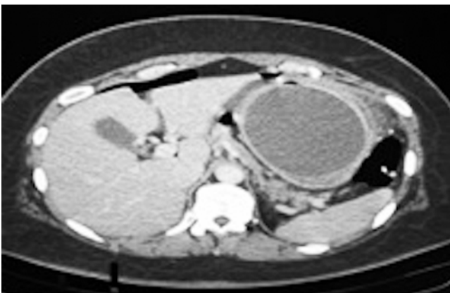
► Fig. 7 CT showing pneumoperitoneum.