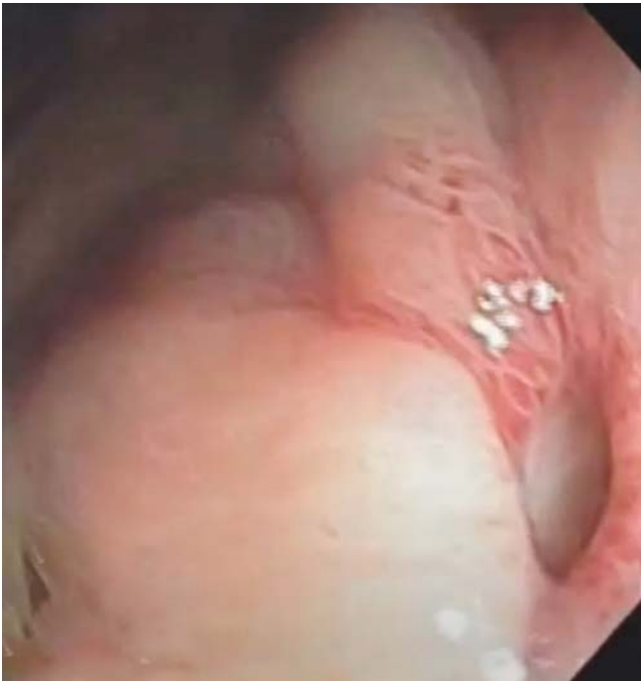
► Fig. 1 Perforation.