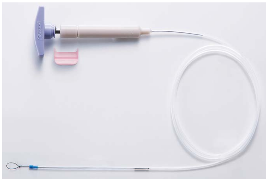
► Fig. 1 The EndoTrac device (Top Corporation, Tokyo, Japan) for traction during endoscopic submucosal dissection.