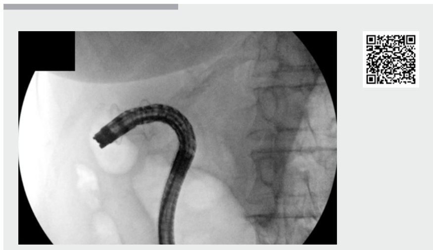
► Video 1 A 64-year-old patient with acute calculous cholecystitis underwent gallbladder drainage with a lumen-apposing metal stent (LAMS). Endoscopic clearance of the gallstones, including two initially missed stones inside the cystic duct, was performed.