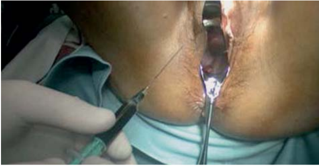
► Fig. 1 Preoperative injection of patent blue (intracervical).