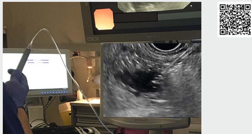
► Video 1 Endoscopic ultrasound-guided gastroenterostomy with water pump filling to expand the duodenum.