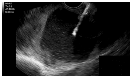
▶ Fig. 1 Insertion of the lumen-apposing metal stent into the jejunum through the descending colon.