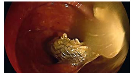
▶ Fig. 3 Endoscopic view of the proximal flange release.