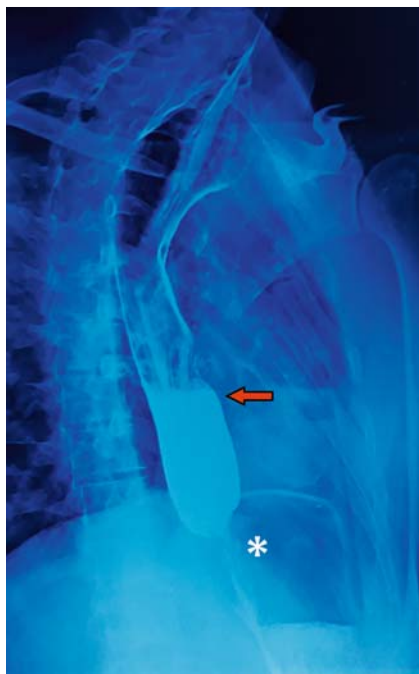
► Fig. 1 Lateral view of barium esophagogram depicting dilated esophagus with pooling of barium (red arrow) and narrowed gastroesophageal junction (asterisk).

and slow withdrawal of the esophagoscope was performed (► Video 1 ). It revealed a fistulous opening at the apex of the diverticulum in the mid-esophagus (► Fig. 4 ).