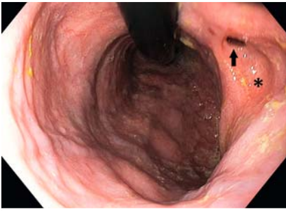
► Fig. 4 Endoscopic image in retroversion depicting a small opening (arrow) at the apex of the diverticulum (asterisk) and dilated esophagus. Esophagoscope is visible at 12 o'clock position.

esophagoscope. Caution should be exercised, however, while performing retroversion during esophageal endoscopic examination, as the limited space may lead to complications.