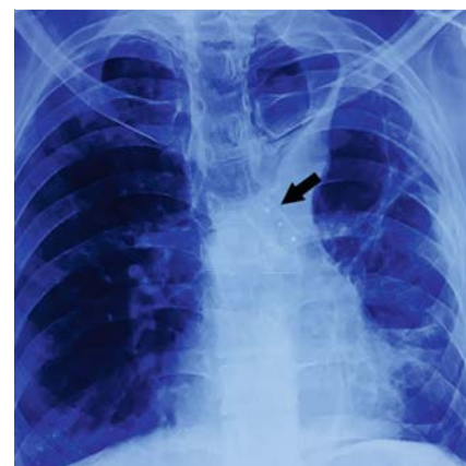
► Fig. 3 Chest x-ray showing fibrosis in the left lung with a metal stent inside the left main bronchus (arrow).

difficult to appreciate it on forward-viewing esophagoscopy, and retroversion of the endoscope can be tried in the dilated esophagus. This case is unique in many aspects in that: 1) bronchoesophageal fistula is rare inside an esophageal diverticula [2]; 2) association with achalasia is rare [3]; and 3) visualization was possible on retroversion of the