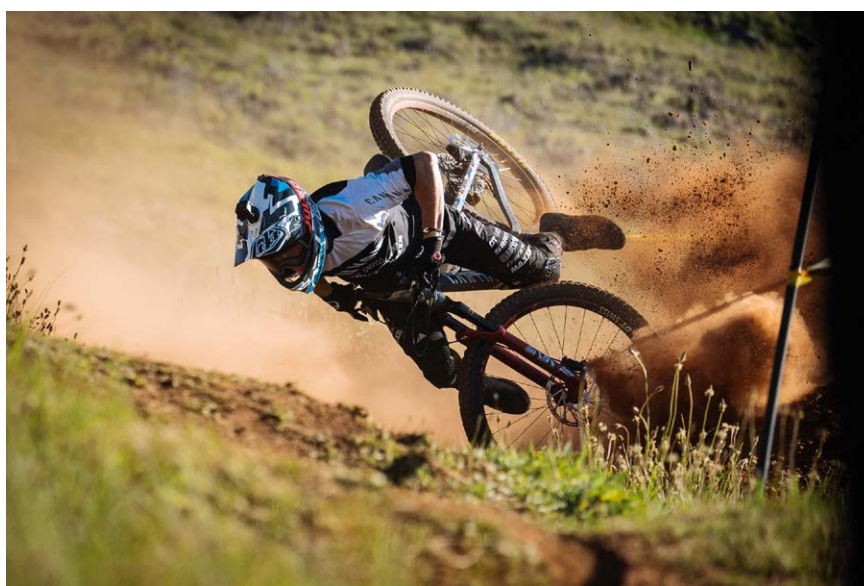
► Fig. 2 Injuries occurred most frequently on steep, dirt/rocky stages.

race injury incidence in the present study was similar to the 43/1000 hours reported in downhill racing in the US [14] and higher than the 20/1000 hours reported in downhill riders from Germany, Luxembourg, Switzerland and Austria [17]. The rate of injury was also higher compared to that reported previously in cross-country mountain bike racing (4.0/1000 hours racing) [8].