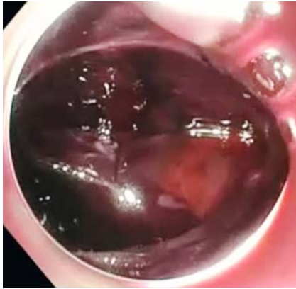
► Fig. 1 Large hematoma at the entrance of the tunnel.