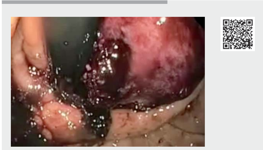
► Video 1 Technique to control bleeding into a tunnel after a peroral endoscopic myotomy.

A 73-year-old woman with history of achalasia for 10 years and a history of Heller myotomy presented with recurrence and underwent per-oral endoscopic myotomy (POEM). A posterior POEM was