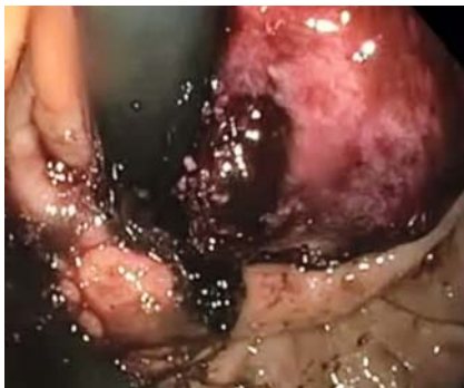
► Fig. 2 Pressure ulcer caused by the hematoma at the esophagogastric junction.

Per-oral endoscopic myotomy (POEM) is a relatively safe procedure in expert hands. Complications associated with POEM include pneumoperitoneum, pneumothorax, and subcutaneous pneumothorax. Bleeding during the procedure can occur and is usually treated with the use of coagulation forceps. Delayed bleeding is rare, occurring in only 0.2–0.7% of patients [1,2].