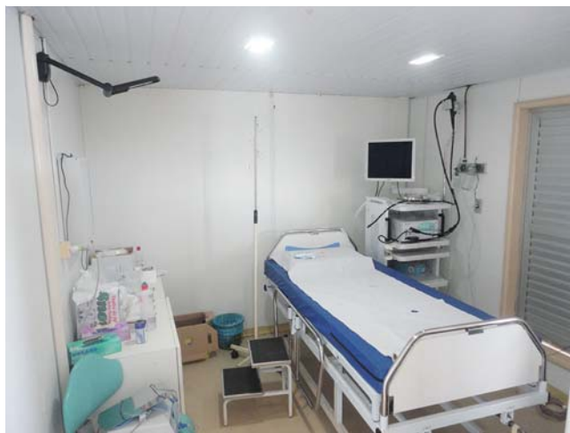
► Fig. 2 View of the inside of an endoscopy unit in Abaré.

products, and other basic items needed for the procedures had to be transported to these health units.