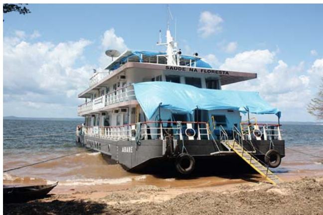
► Fig. 1 The Abaré boat, a floating hospital where two endoscopy units were built to increase access to gastrointestinal screening among remote riverside populations.