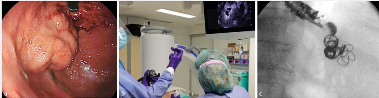
► Fig. 1 Deployment of the embolization coil. a Large, gastric variceal conglomerate in a patient with recent bleeding. b Endoscopic ultrasound-guided transesophageal deployment of a large cylindrical-shaped coil (Nester coil; Cook Medical, Bloomington, Indiana, USA) through a 19 G needle (Echo-tip; Cook Medical). c Fluoroscopy image of multiple coils delivered into a large gastric varix (coil packing).

The procedure is performed under oro-tracheal intubation. The echoendoscope is positioned in the distal esophagus or in the gastric fundus to visualize the gastric varices; if necessary, water may be instilled into the fundus to improve visualization. Detection of the feeding vessel is unnecessary owing to the complexity of the vessel network and is time-consuming.