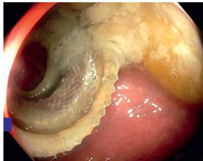
▶ Fig. 2 Endoscopic control before stoma removal showing permeability of the lumen-apposing metal stent.