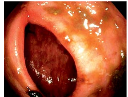
▶ Fig. 3 Large and permeable anastomosis after stoma removal and migration of the lumen-apposing metal stent.