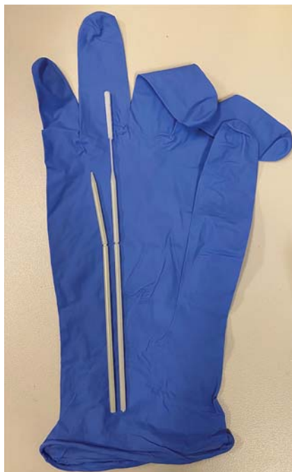
► Fig. 1 The COVID nasopharyngeal swab with broken tip from the patient compared to an intact COVID swab, with a medium-sized surgical glove in the background for comparison.

Deep nasal swab novel coronavirus (COVID-19) testing has become routine practice prior to hospitalization and almost all medical procedures since the start of the pandemic. We present the case of a 35-year-old woman at 40 weeks gestation who presented to the hospital for a scheduled elective induction and delivery for full-term pregnancy. On admission, she underwent routine testing for COVID-19 with deep nasal swab. The swab was inserted into her left naris, and while being rotated, broke off at the indicator line in the patient's posterior nasopharynx (► Fig. 1 ). Almost immediately, the patient felt pain in her throat that quickly subsided. Because the swab tip was lost, the patient underwent a second uneventful COVID-19 deep nasal swab, which was negative.