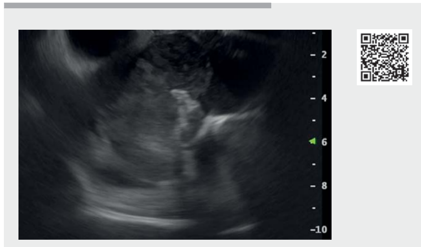
▶ Video 1 Accidental diagnosis of a right atrial mass during endoscopic ultrasound in a patient with intraductal papillary mucinous neoplasm of the pancreas and dyspnea.