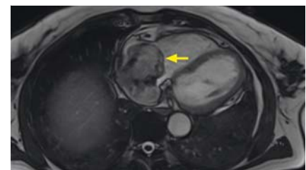
▶ Fig. 3 Magnetic resonance imaging of the right atrial mass.

A 70-year-old woman with a 10-year history of a 30-mm pancreatic cyst was referred to our center to continue follow-up. Of note, before the procedure she reported worsening dyspnea and fatigue over the last 4 months. However, no significant alterations were found on either preliminary cardiological or pneumological evaluation. Endoscopic ultrasound (EUS) confirmed the multilocular cystic lesion in the pancreatic body originating from the branch ducts, with focally thickened enhanced walls and a dilation of the main pancreatic duct (6 mm), as per a mixed-type intraductal papillary mucinous neoplasm (IPMN) with worrisome features. While withdrawing the echoendoscope into the mediastinum, a mainly hyperechoic 70×50-mm inhomogeneous mass was detected in the right atrium (▶ Video 1 ), with an extension towards the superior vena cava access (▶ Fig. 1 ). Owing to the suspicion of a cardiac mass, multimodality cardiac imaging