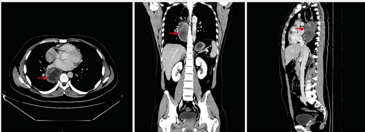
► Fig. 2 Computed tomography scan showed a huge (5.6×4.4×14.7 cm) intraluminal mass (arrows) in the esophagus.