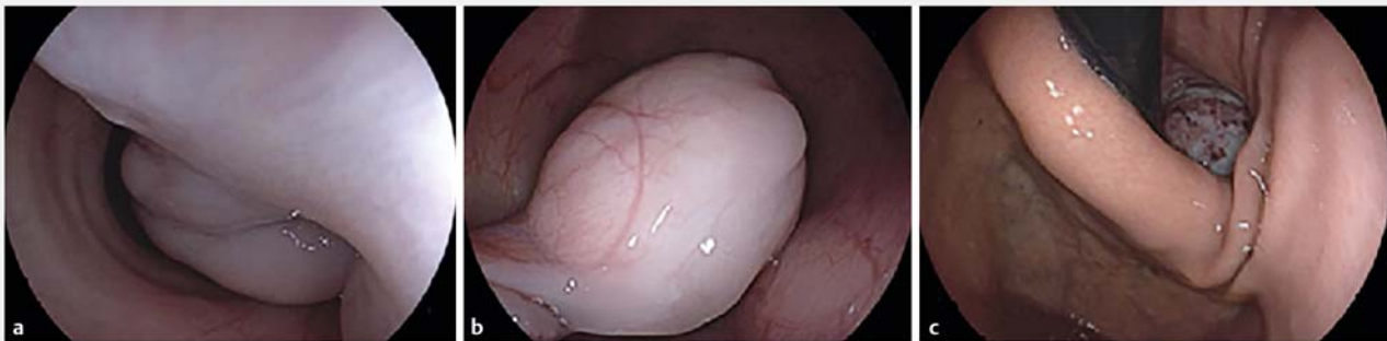
► Fig. 1 Esophagogastroduodenoscopy showed a huge pedunculate submucosal tumor in the esophagus. a The root of the peduncle. b The body of the tumor. c Partial erosion on the surface of the tumor (retroflexed endoscopic view).

peduncle. A knot was tied in vitro and pushed into the esophageal cavity using a laparoscopic knot pusher. The root of the peduncle was ligated by three sutures and then resected using a HookKnife (Olympus) between the ligations. The specimen could not be retrieved through the mouth and was instead pushed into the stomach. The tumor was removed by incision of the stomach through a single-port laparoscope (► Fig. 3, ► Video 1). The patient resumed a liquid diet 3 days after surgery and body temperature returned to normal.