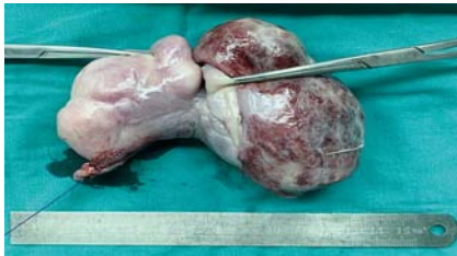
► Fig. 3 The resected tumor specimen.