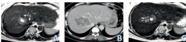
► Fig. 3 Example of an incomplete ablation. A Pre-procedural T2-weighted MRI-Image of a colorectal metastasis adjacent to the middle liver vein (arrows). B Post-interventional control-CT-scan in hepatic portal phase one day after MWA of the metastasis. C T2-weighted MRI-Image four weeks after MWA with detectable residual tumor adjacent to the middle liver vein, in the sense of incomplete ablation, probably due to the heat sink effect.