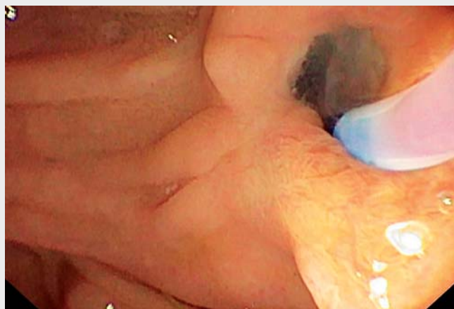
► Video 1 Intraductal papillary mucinous neoplasm of the Santorini duct in a patient with pancreas divisum diagnosed by transpapillary biopsy.