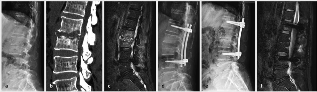
► Fig. 1 A 68-year-old man patient with L2, L3 tuberculosis. The instrumentation was performed from the posterior approach without radical debriding of the lesion. a,b Preoperative plain radiograph and 3 D CT demonstrating bone erosion at the inferior portion of the L2 and superior portion of the L3 vertebral bodies. c Preoperative T2-weighted MRI revealing spinal cord compression at the level of L2 and L3. Areas of high signal intensity can be seen at the involved bodies, abscess, and the paravertebral soft tissue mass. d Plain radiograph 1 week postoperatively. Only long-segment posterior instrumentation was performed without extensive decompressive surgery. e Postoperative plain radiograph obtained at the 20-month follow-up demonstrating that the transpedicular instrumentation has not loosened, and spontaneous bone fusion was observed in the L2 and L3 vertebral bodies. f Postoperative T2-weighted MRI at the 20-month follow-up examination revealing almost complete disappearance of the paravertebral soft tissue mass and abscess, and normalization of the signal intensity of the L2 and L3 vertebral bodies. Spontaneous bone fusion was observed in the L2 and L3 vertebral bodies.