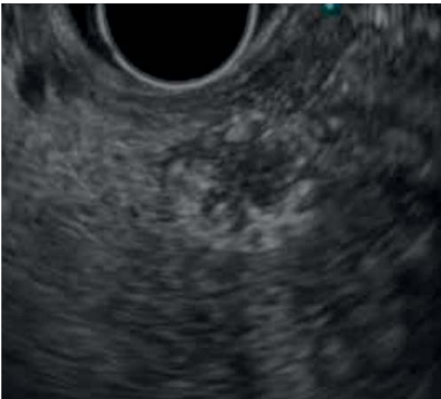
► Fig. 2 Final result, immediately after EUS-RFA application.