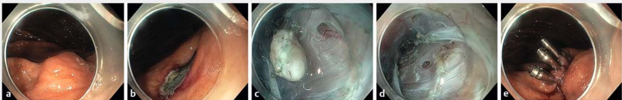
► Fig. 2 Submucosal tunneling for endoscopic resection. a Subepithelial lesion in the stomach before STER. b Opening of the tunnel with horizontal incision. c Isolation of the lesion within the tunnel created. d Removal of the lesion leaving an empty tunnel. e Closure of the opening with clips.