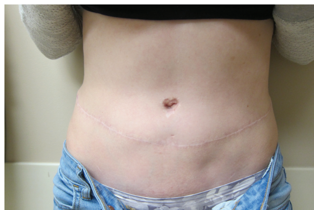
Fig. 5 Postoperative photo of the donor at 1-year follow-up.

only one of the authors reported utilizing immunosuppression (1 month of short steroid taper) as recommended by their hospital's transplant service. 7 No flap transplant rejections were reported.