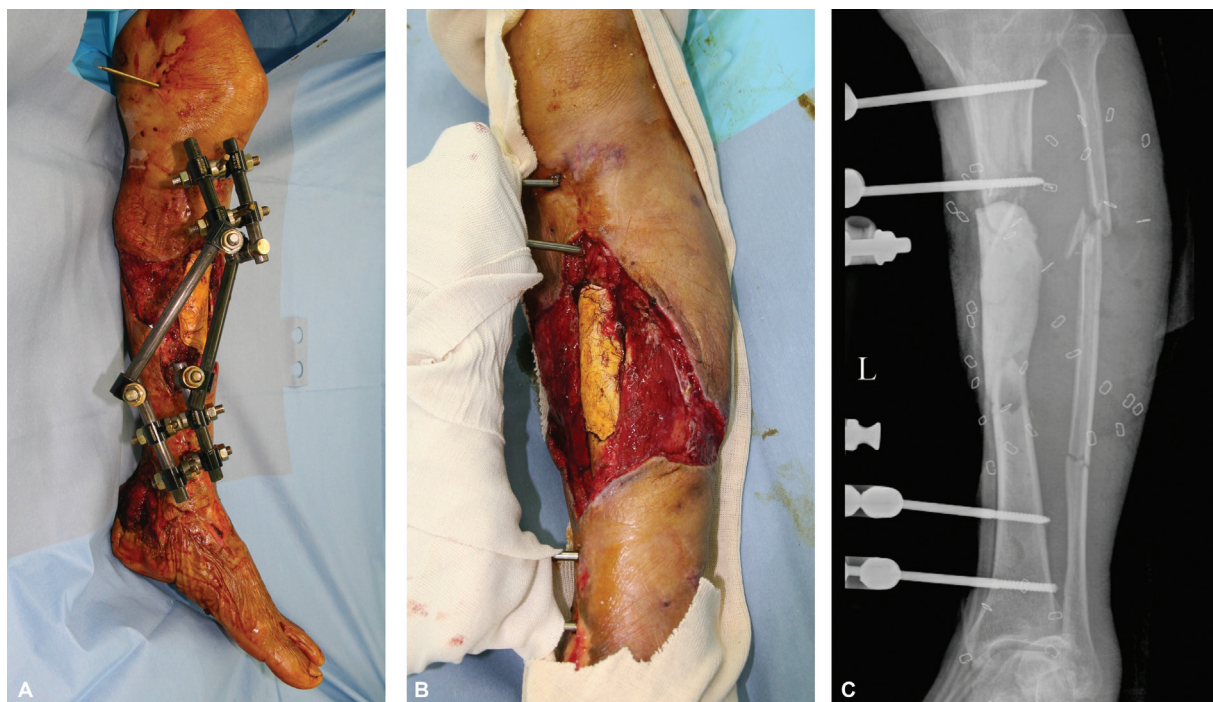
Fig. 1 Necrotic tissues were debrided including proximal tibia bone and soft tissues. External fixator system was applied (A). Bone cement was inserted where the tibia defect was (B). Cortical bone defects of tibia and segmental fracture of fibula was revealed in simple X-ray after three times debridement (C).

After wound stabilization and confirmation that there were no signs of infection, reconstruction of the bone and soft tissue was planned, with close discussion between the orthopaedic surgery and plastic surgery teams. In the preoperative computed tomography angiography, fortunately, all the main vessels of the lower extremity were found to be