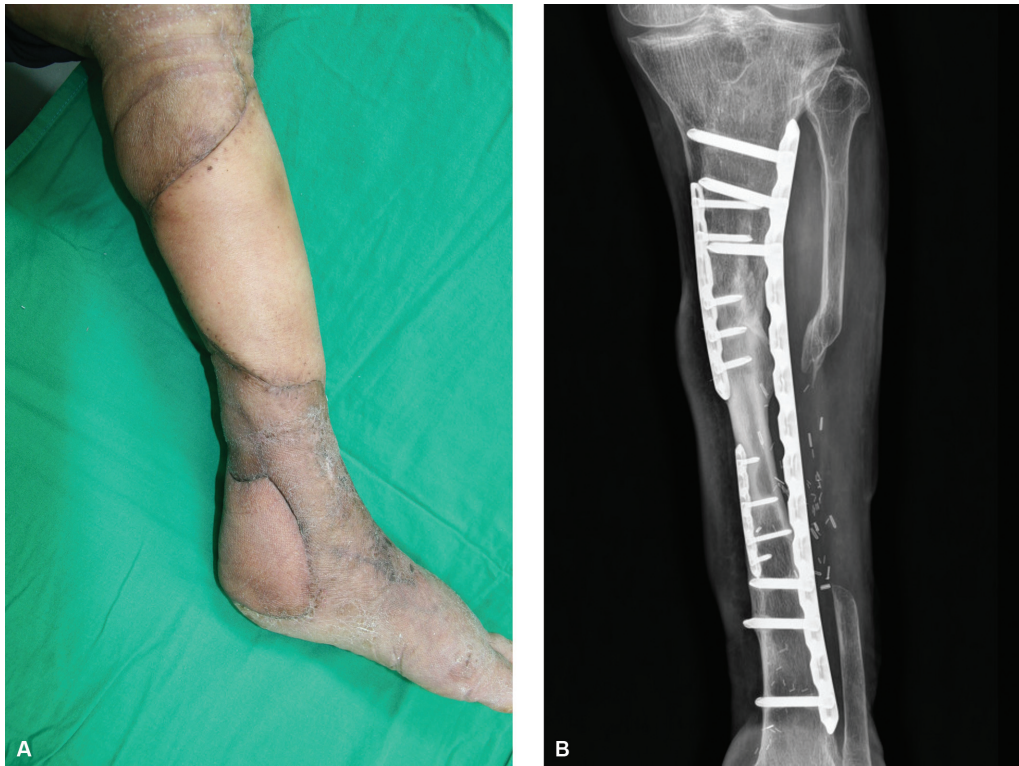
Fig. 4 Long-term follow-up view showed good contour without any debulking procedures (A). Bone union proceeded well and the transferred fibula had hypertrophied by 3 months later (B).

crutch. Moreover, donor site morbidity was insignificant due to the use of two perforator flaps from the lateral thoracic region without sacrificing any muscle.