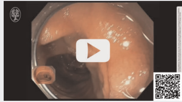
► Video 1 An en bloc CSP followed by a piecemeal CSP in the same session in a patient with extensive duodenal polyposis.

present in the resected adenoma and/or when there were other lesions in the duodenum and/or stomach that required intervention. Otherwise, follow-up endoscopy was scheduled after 1 year. During follow-up endoscopy, the polypectomy scar(s) were assessed to detect recurrences.