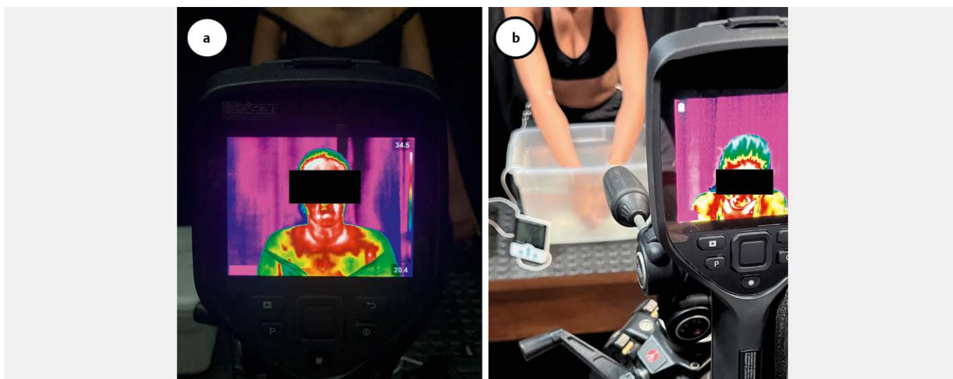
► Fig. 1 (a) Camera FLIR E75 positioned for acquisition before cold protocol; (b) immersion of both hands in a container of cold water for 5 min.