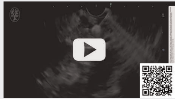
► Video 1 Pancreatic duct stone fragmentation.

The tip of the needle was then redirected using the elevator and the stone was further fragmented using laser lithotripsy (► Video 1 ). Stone fragmentation was visualized during the EUS procedure and on fluoroscopy upon completion of the procedure (► Fig. 4b ). Following the procedure, there was no evidence of contrast retention within the PD.