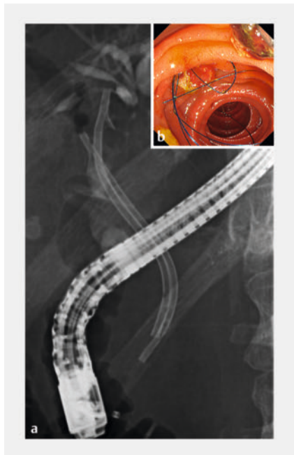
▶ Fig. 2 Fluoroscopic image with a duodenoscopic view after inside plastic stent deployment. a Fluoroscopic image demonstrating double-inside plastic stent indwelling at the hilar stricture in a side-by-side position. b In the duodenoscopic view, four removal threads of the plastic stents were washed into the appropriate lumen.