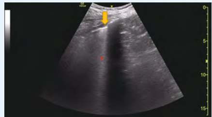
► Fig. 1 LUS findings in patient with COVID-19. Thick indented, asymmetrical pleural line (yellow arrow), with pathological vertical B-line (red asterisk).

PPV, positive predictive value; NPV, negative predictive value.