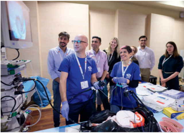
► Fig. 4 Hands-on training during ESGE Days 2024 – Practical demonstrations.

These workshops are a clear example of the increased collaboration between ESGE and ESGENA to promote working in teams.