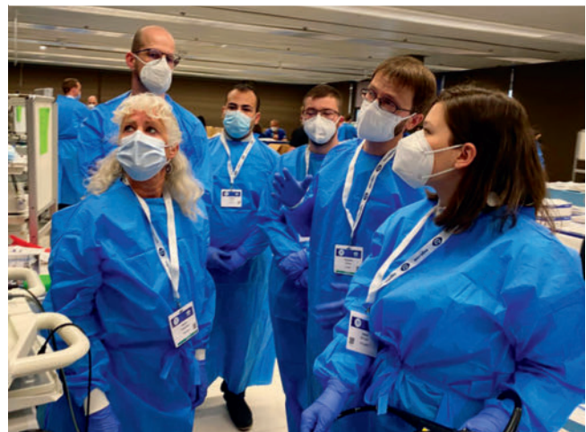
► Fig. 3 Team discussion at the hands-on training during ESGE Days 2022.

In the late 1990s, ESGENA was involved in many ESGE workshops in the Eastern European countries which combined live endoscopy demonstrations, didactic lectures and hands-on training for local endoscopists and nurses. In these workshops a clear teamwork was established between ESGE and ESGENA,