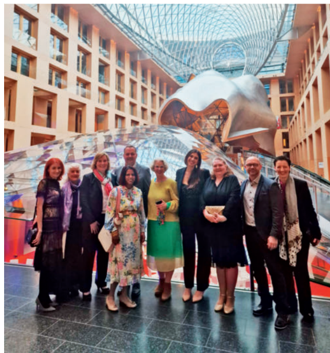
► Fig. 1 ESGENA Governing Board, Scientific and Technical Secretariat at ESGE Days 2024.

ESGENA is member of the European Specialist Nurses Organisation (ESNO) which represents the interests of specialist nurses on the European level. This co-operation is politically very important because ESNO is our voice in Brussels and our platform to share experiences with nurses from other speciality fields.