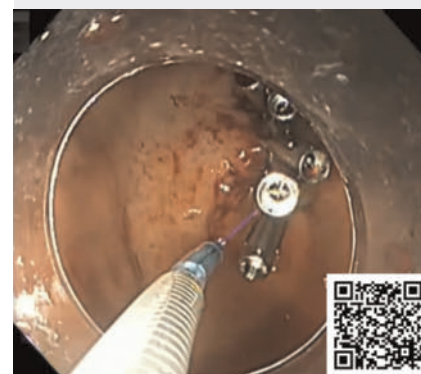
► Video 1 A disposable snare is used to lock the suture threads after reopenable clip over line method (ROLM) suturing has been performed following gastric endoscopic submucosal dissection.