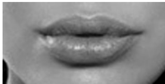
Figure 2 A photograph of a youthful lip, demonstrating fullness, slight eversion of the lower lip, visibility of the wet-dry junction of the lower lip, and preserved vertical rhytides.

Another example of a potential change in minimally invasive procedures was demonstrated in the study of the deep medial fat compartment of the cheek by Rohrich et al. 19 When saline was injected into the deep