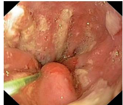
Fig. 2 Multiple well-demarcated superficial erosions with a white patchy surface in the distal esophagus.