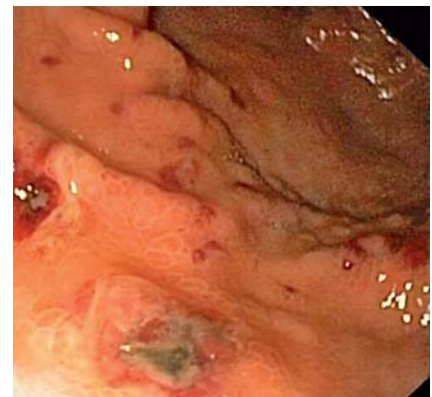
Fig. 3 Ulcers with central necrosis along the greater curvature of the corpus of the stomach.