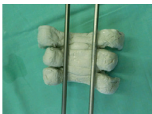
Fig 7 Model showing placement of rods.