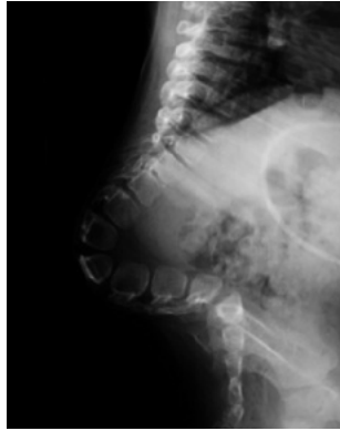
Fig 2 Preoperative x-ray of the spine in the kyphotic area.