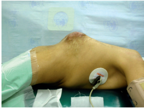
Fig 1 Preoperative image of a child after being placed on the operating table; note two silicon rolls lowering pressures from the chest.