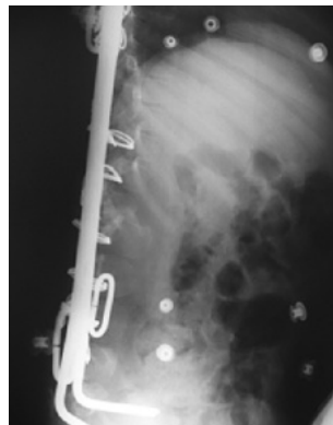
Fig 6 X-ray of the spine; 2 years postoperative fusion is seen at the level of the kyphosis.