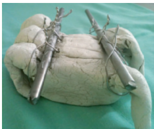
Fig 9 View from underneath.