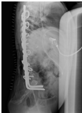
Fig 4 Postoperative x-rays of the spine.