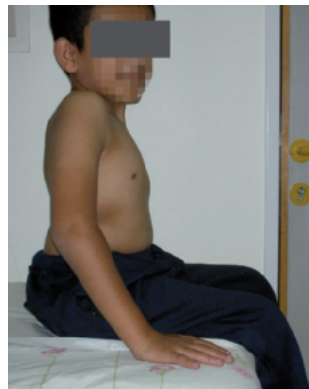
Fig 5 The child 2 years postoperatively.